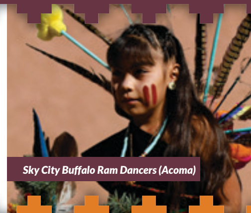
Sky City Buffalo Ram Dancers (Acoma)